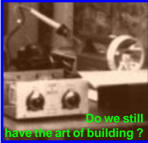
Do we still have the art of building ?